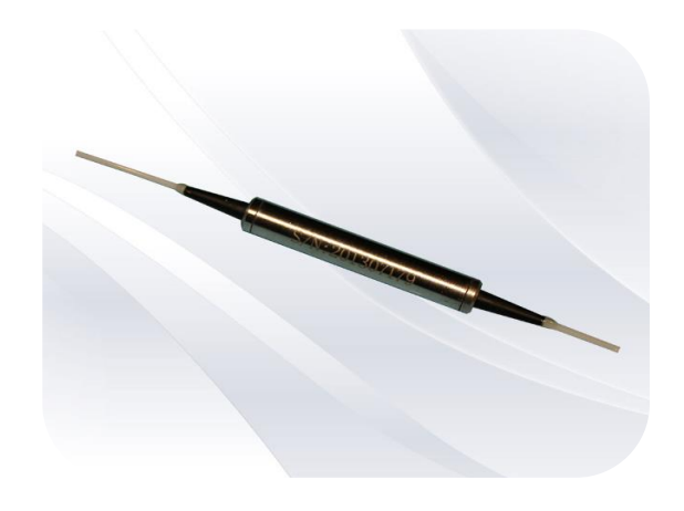
Standard Fiber Pigtailed Etalon