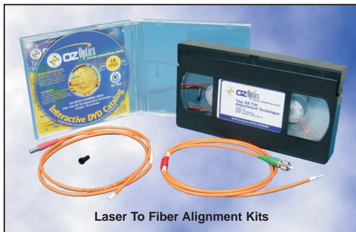
Laser To Fiber Alignment Kits

Perhaps the most difficult task is to align the polarization axis of lasers to the polarization axis of PM fibers. The polarization alignment tool makes this adjustment in seconds. The tool consists of a connector that fits the receptacle on the laser to fiber coupler. Inside the connector is a polarizer, aligned 90 degrees to the key on the connector. The operator simply inserts the tool into the coupler, and monitors the strength of the output light while rotating the laser to fiber coupler. When the light through the tool is blocked as much as possible, the key on the connector is correctly aligned with the key on coupler. The operator then simply connects his PM fiber to the coupler and aligns it for