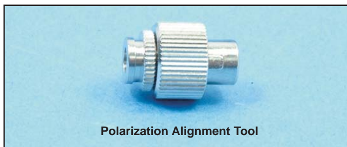
Polarization Alignment Tool