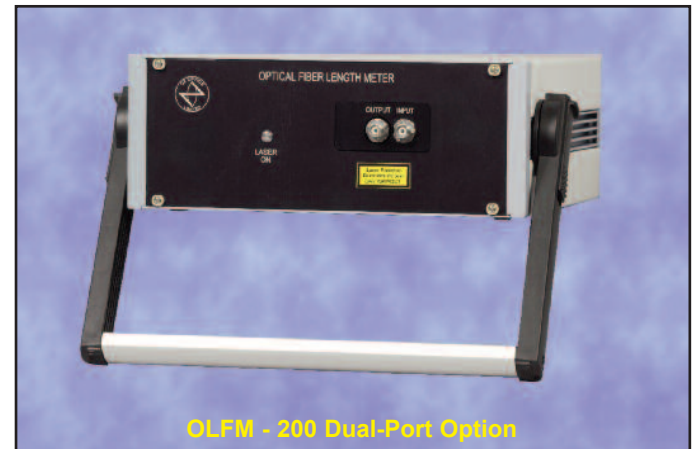
OFLM - 200 Dual-Port Option