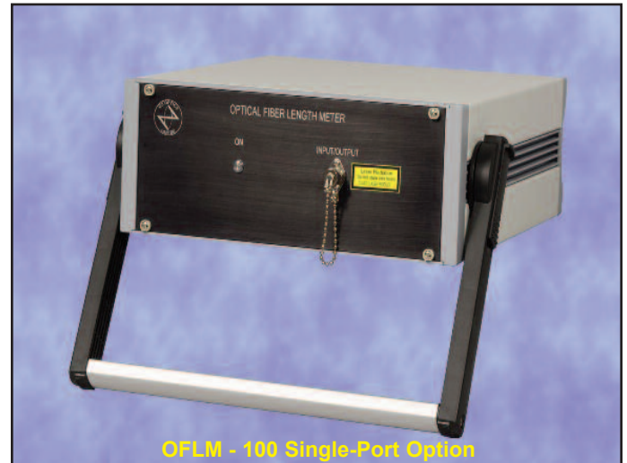
OFLM - 100 Single-Port Option

With resolution and repeatability of less than 2 mm, the OFLM-100 delivers highly accurate optical path length measurements for distances up to 500 m. The system reports and records its measurements to any Windows based personal computer, allowing easy data logging and report writing.