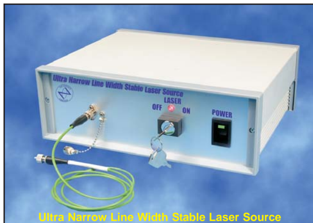
Ultra Narrow Line Width Stable Laser Source