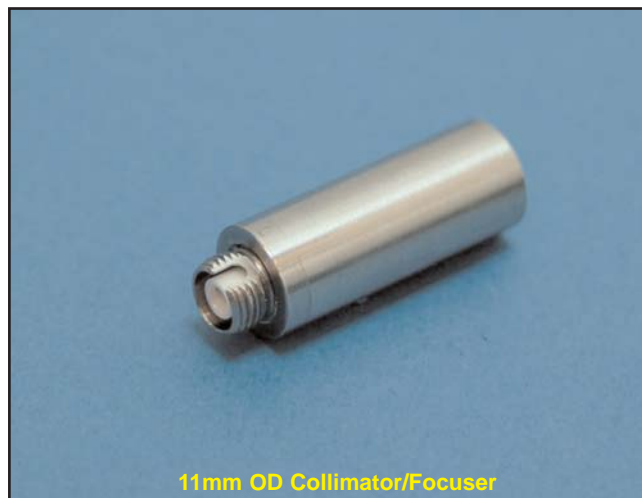
11mm OD Collimator/Focuser