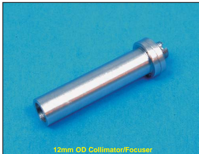
12mm OD Collimator/Focuser