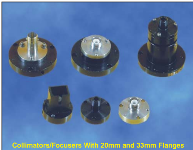
Collimators/Focusers With 20mm and 33mm Flanges

OZ Optics standard tables list the definitions used for each fiber type, as well as conversion factors to convert values to 1/e^2 values. OZ Optics uses 1/e^2 definitions for its calculations of the beam diameter wherever possible.