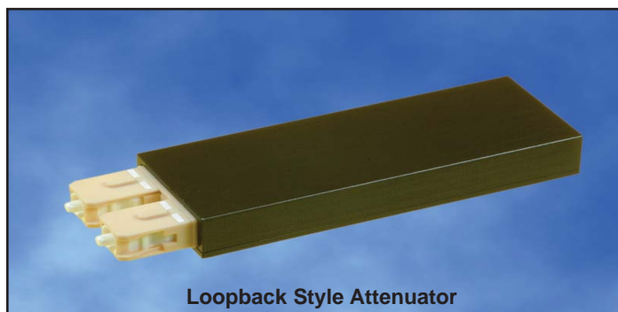
Loopback Style Attenuator