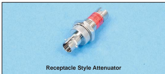
Receptacle Style Attenuator