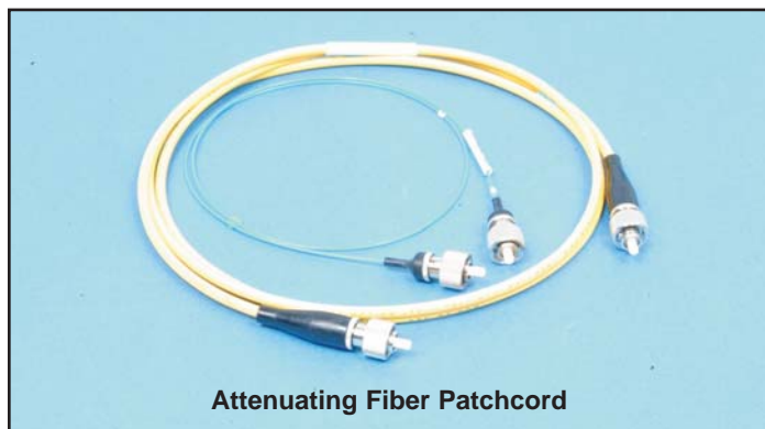
Attenuating Fiber Patchcord