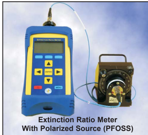
Extinction Ratio Meter With Polarized Source (PFOSS)