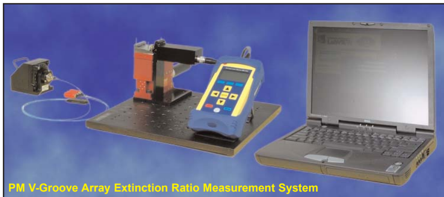
PM V-Groove Array Extinction Ratio Measurement System

The system works by first setting the software configurations for the appropriate V-Groove size and spacing. The V-Groove chip is then attached to the mounting stage and the opposite end of the fiber is attached to the polarized source. After adjusting the stage to roughly align the fiber to the meter, the software is started to take the ER measurement and automatically move the array to the next fiber position. Manual recording of the measured ER and angle is required at this point, optional software is available to log the measurements for later use. At the software prompt, the user must change the fiber on the polarized stable source so the next measurement can be taken.