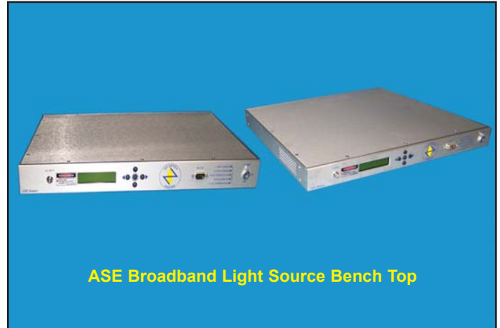
ASE Broadband Light Source Bench Top

Sources are available to cover the C-band, L-band, or both the C & L bands together. These are available with either a flattened spectral output for demanding applications, or a non-flattened response for less demanding or cost-sensitive applications. A range of output powers are available.