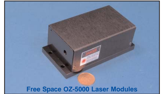
Free Space OZ-5000 Laser Modules