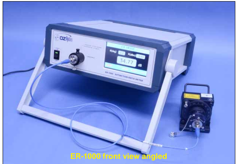
ER-1000 front view angled

The detection circuitry for the ER meter has an overall dynamic range of about 60 dB. When the input signal has a power level within the range of 300 \mu W to 1 mW (a 5 dB range), this leaves at least a 55 dB range for the ER measurement itself. Since the extinction ratio is based on the ratio of two values, a minimum and a maximum, the minimum value may approach the noise floor of the instrument if the extinction ratio is really good or the input power is close to 300 \mu W or below. In such a case, the minimum value may default to the noise floor of the instrument. Under these conditions, the instrument may not be able to provide an accurate reading. However, it will be able to determine a worst case value, which will be indicated to the user as such. By using a higher-powered source, the instrument will be able to provide an improved reading. For example, with a low power signal, the ER meter may indicate that an extinction ratio is >27 dB. If the user needs to know whether the actual value is over 30 dB, then a more powerful source should be used. If the ER meter has an optional attenuator installed, the user could simply remove the attenuator.