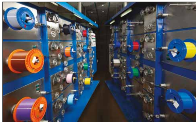
Quality Inspection of Fiber Optic Cable