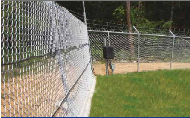
Border Security Monitoring