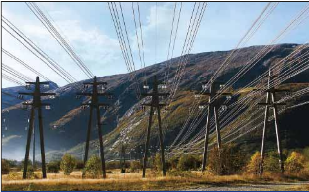
Overhead Power Line Monitoring