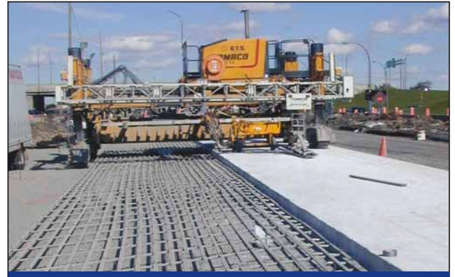
Highway Safety Monitoring