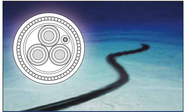
Submarine Cable Monitoring