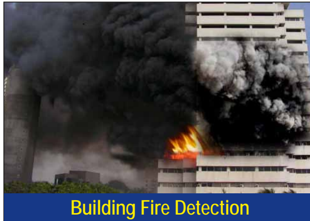
Building Fire Detection