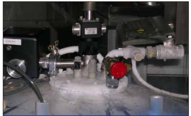
Cryostat Temperature Sensing