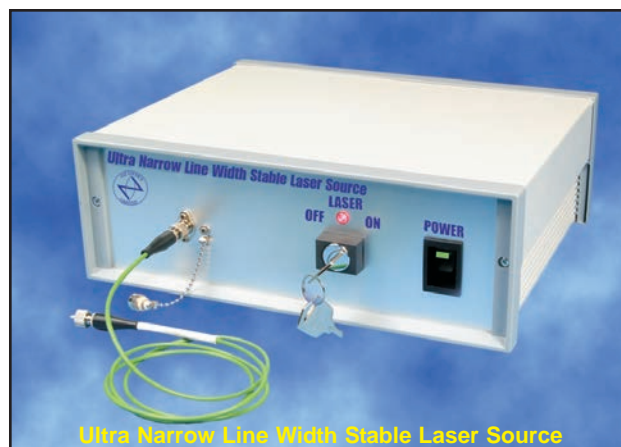
Ultra Narrow Line Width Stable Laser Source