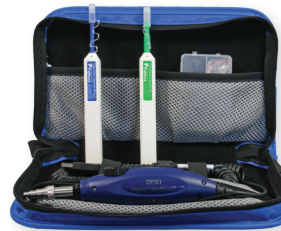
DFS1 FiberScope Inspection Kit