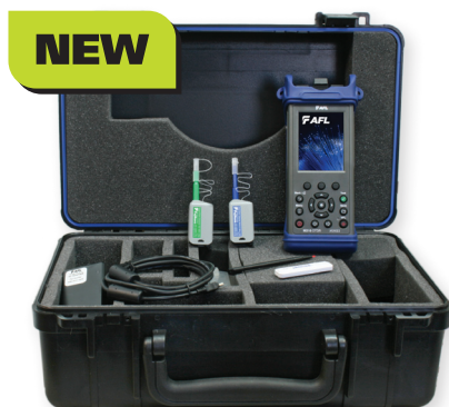
M210 OTDR in Hard Transit Case