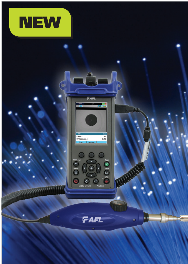
M210 OTDR with DFS1 Digital FiberScope

Test, Troubleshoot and Document Single-mode and Multimode Fiber Networks