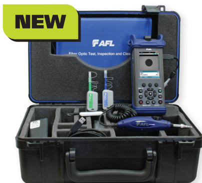
M210 QUAD Test and Inspection Kit (Tier 2)