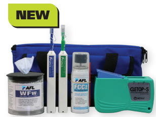
FCP2-00-0900 Basic Cleaning Kit