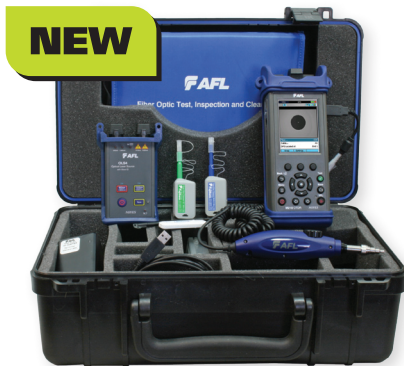
M210 QUAD Certification Kit (Tier 1 and Tier 2)