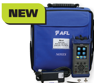
M210 OTDR in Soft Case