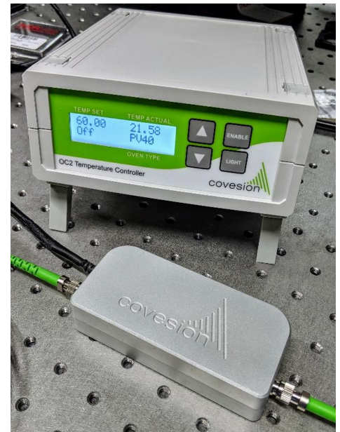
Covesion packaged waveguide use with temperature controller OC2

Contact us with your specification to discuss availability and pricing