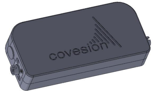
Covesion packaged waveguide

[Unit: mm. Image for reference only. Not to scale]